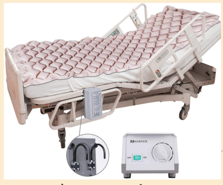
alternating pressure mattress