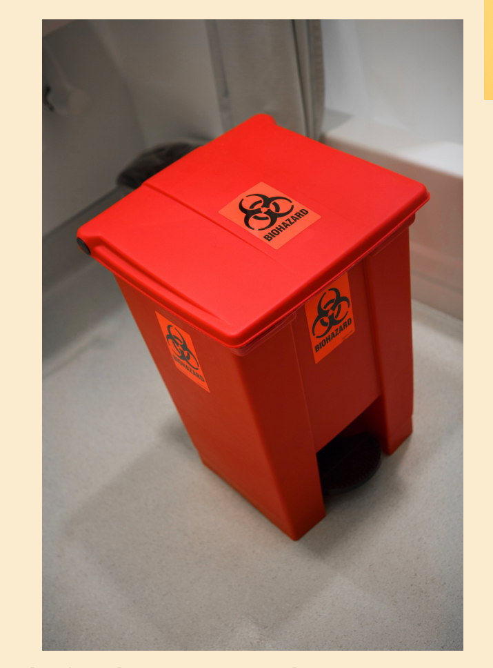
biohazard waste container